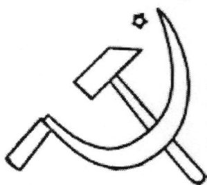
Hammer, Sickle and Star